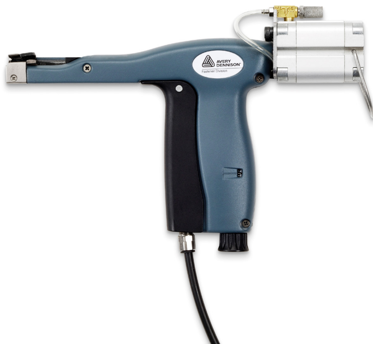
Pneumatic version makes installation faster and easier